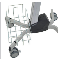
NF CART WIRE BASKET KIT 97-544