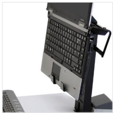
NF CART LAPTOP VERTICAL KIT 97-546