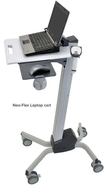
Neo-Flex Laptop cart