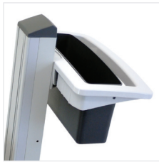
NF CART HANDLE AND BASKET KIT 97-545 (GREY)