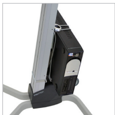
UNIVERSAL CPU HOLDER 80-105-064 (DARK GREY)