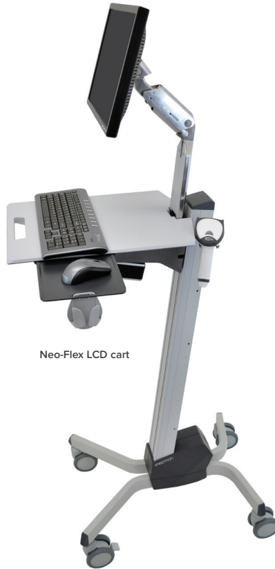
Neo-Flex LCD cart