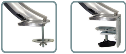
MOUNT TO YOUR DESK WITH EITHER A GROMMET MOUNT OR A DESK CLAMP