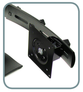
MONITORS CAN BE ALIGNED INTO A SEAMLESS CURVED PROFILE TO BENEFIT VIEWING.