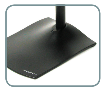
SLEEK, LOW-PROFILE BASE WITH DURABLE FINISH PROVIDES STABILITY AND SAVES SPACE.