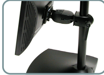
MONITOR HEIGHT CAN BE ADJUSTED ON POLE (33-091-200 SHOWN). 28" POLE (20-137-200) ALSO AVAILABLE, ORDER SEPARATELY.