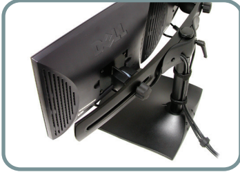
CABLES ARE GUIDED CLEANLY THROUGH CABLE CHANNELS