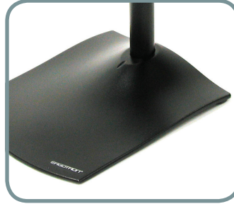
SLEEK, LOW-PROFILE BASE WITH DURABLE FINISH PROVIDES STABILITY AND SAVES SPACE.