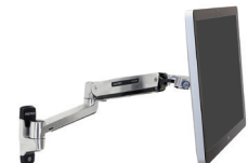
LX HD Sit-Stand Wall Mount LCD Arm