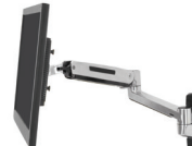
LX Sit-Stand Wall Mount LCD Arm