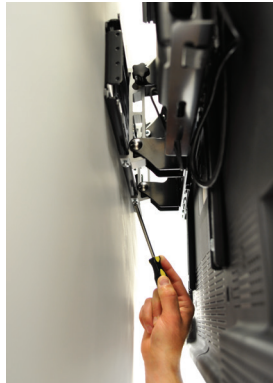
INCLUDES SCREWS TO SECURE DISPLAY FOR THEFT DETERRENCE