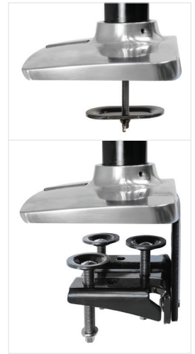
DESK CLAMP ATTACHES TO EDGE UP TO 2.5" (65 MM) THICK