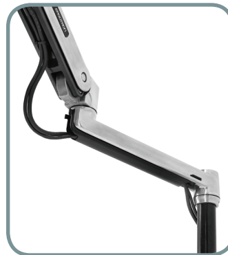
CABLE MANAGEMENT CLIPS ON THE UNDER SIDE OF THE ARM ROUTE AND HIDE CORDS